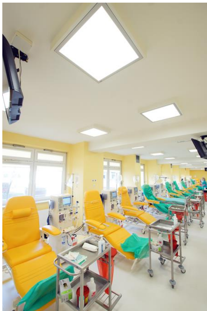
Dialysis station, hospital in Łomża

Luminaire is recommended to be used in medical sector to illuminate such premises as: operating rooms, rooms designed for laparoscopic and endoscopic, surgeries and interventions, recovery rooms, dermatological offices and to illuminate blood collection centres, etc. Surface mounted luminaire equipped in highly efficient LED sources. Luminaire body made from steel sheet, powder coated in white. Diffusers and optical systems in aluminum frame. This product is manufactured in production plant which holds quality management system for medical devices ISO 13485.