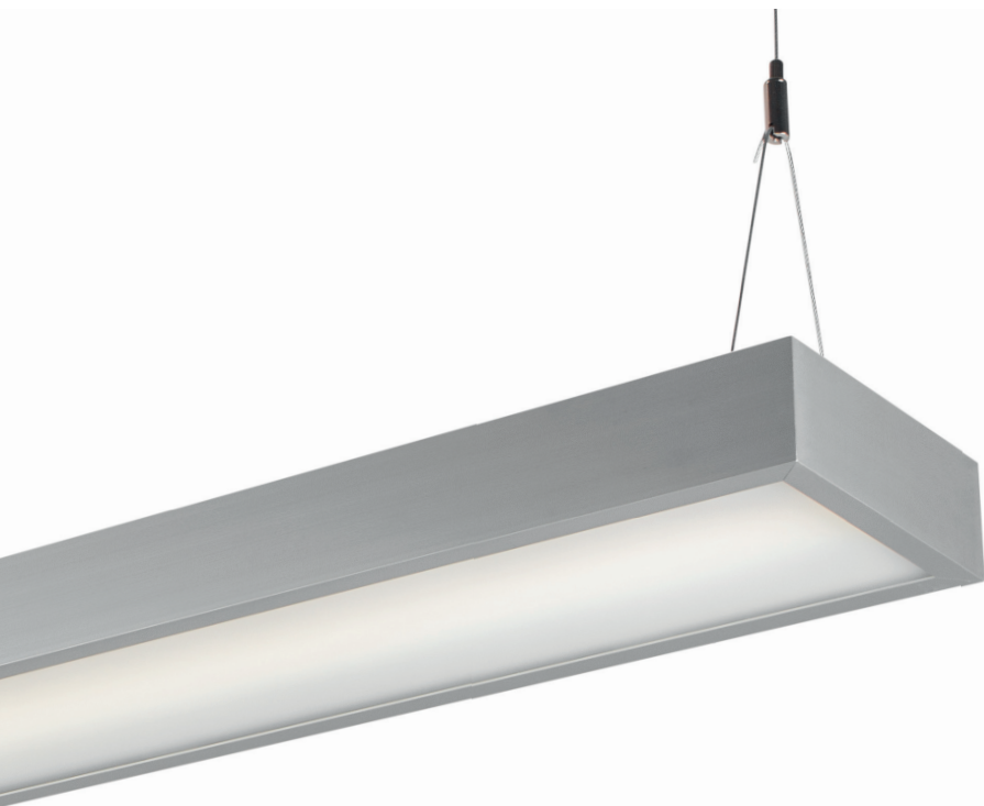
with cover 070, 072 and 090