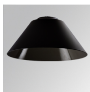
Product code: 10400102 Description: STORMBELL ACC. BELL BK.