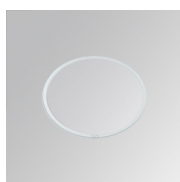
Product code: 10400140 Description: STORMBELL ACC. TRANS GLASS