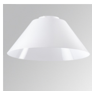
Product code: 10400120 Description: STORMBELL ACC. BELL OPAL