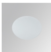
Product code: 10400150 Description: STORMBELL ACC. OPAL GLASS