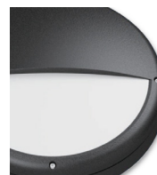
RX TYPHOON EYELID TRIM GREY REXBHREYETRM