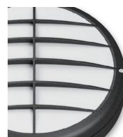
RX TYPHOON GRILLE TRIM GREY REXBHRGRLTRM