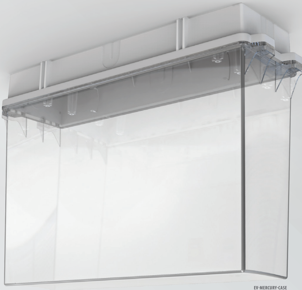
EV-MERCURY-CASE CODE: 03922

WEATHERPROOF ENCLOSURE FOR MERCURY AND MERCURY BASIC