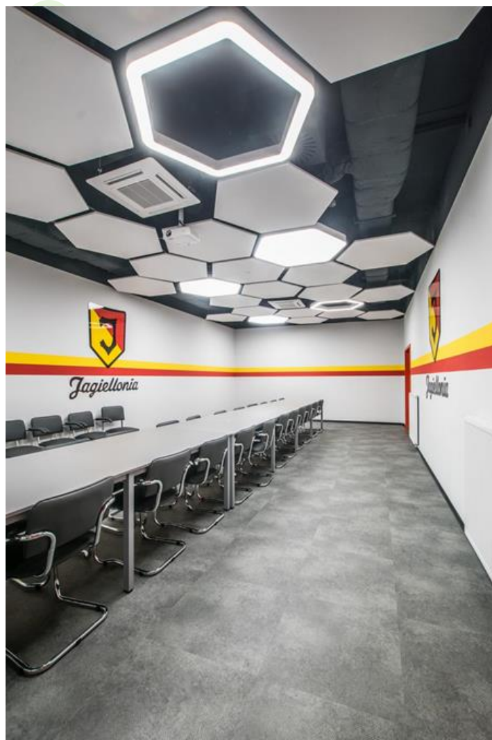
Jagiellonia Białystok - training center

Modernistic architectural luminaire in shapes of popular geometrical figures and fashionable design of simple form. The luminaire is adjusted to be mounted on the ceiling or suspended. It is equipped with highly efficient LED light sources. Various options of luminous flux and colour temperature are available. The sides of the shade are made of thin-walled aluminium profile. In combination with a possibility of painting according to RAL palette, the luminaires allow to achieve a unique arrangement of various premises. Perfectly even surface-emitting is made of material which has very good light transmittance factor and has good diffusion parameters. This luminaire is dedicated to room of high stylistic requirements. It is perfect for hotel atrium, office receptions, architectural studios, conference rooms or halls and corridors in exclusive buildings as well as for theatres or modern shops in shopping centres.