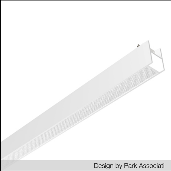
Design by Park Associati