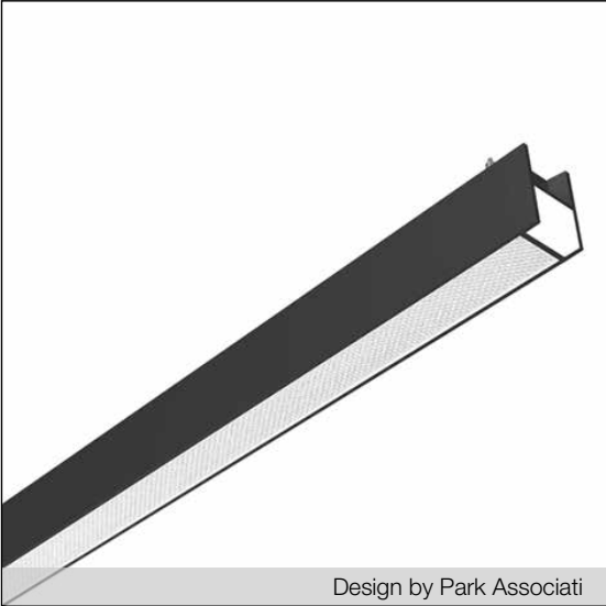
Design by Park Associati