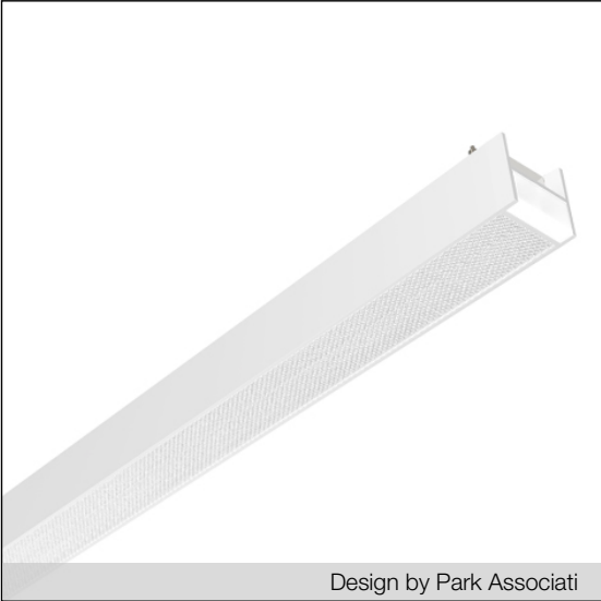
Design by Park Associati